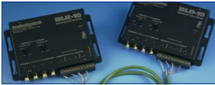
BLD-10 / BLR-10 Four Channel Balanced Line Driver/Receiver

The BLD-10 Balanced Line Driver and the BLR-10 Balanced Line Receiver provide an easy way to extend four channels of audio up to 1000' using inexpensive twisted-pair wiring without any noise pickup.