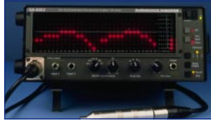
SA-3052 One-Third Octave Audio Analyzer

Serious audio systems require serious tools. The SA-3052 portable one-third octave real-time audio analyzer gives installers an important window on acoustics. Setting sound levels and adjusting equalizers is now a science instead of guesswork.