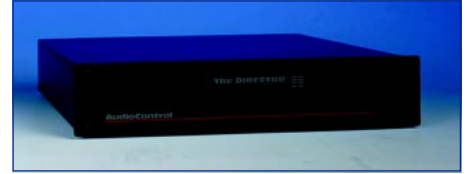
The Director Model 46 Multi-Room Audio Controller

This is the next generation. The Director Model 46 has four major features you will not find on any other multi-room controller. It is attractive, easy to use, extremely flexible, and a reliable, truly professional, multi-room controller. This will make your day.