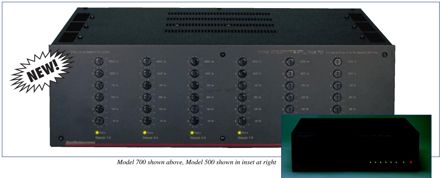
Model 700 shown above, Model 500 shown in inset at right